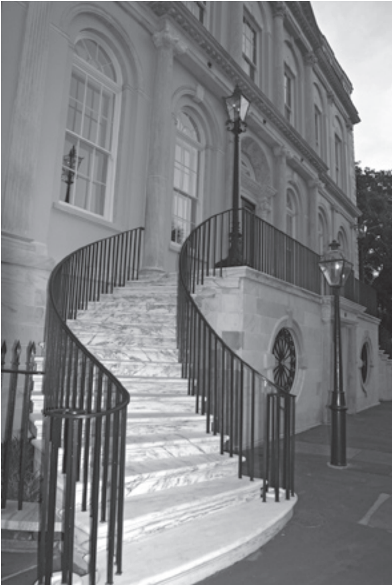
City Hall Stairs, Charleston, South Carolina

tours will leave from the hotel on Sunday—a morning guided tour of the historic Charleston city and the Citadel, and an afternoon Harbor Cruise. On Monday, there will be four tours departing from the hotel: 1) a morning tour to Magnolia Plantation and Gardens, 2) an all day tour to Brookgreen Gardens and Huntington Beach State Park, 3) an afternoon Eco Tour that will take you to natural habitats of shore birds, wading birds, dolphins in the harbor and more, and 4) an afternoon guided tour of Charleston and the Citadel. On Tuesday, there will be four more tours: 1) a morning tour to Middleton Place Plantation and Grounds, 2) a morning guided