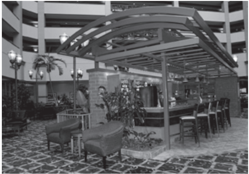
Embassy Suites Hotel

The Embassy Suites hotel is located near the airport in North Charleston, South Carolina and is connected to the Convention Center where we will conduct our conference. The hotel is located on International Boulevard at the intersection of I-26 and I-526 just a mile from Charleston International Airport. The hotel rooms are two-room suites in one of the top five-rated Embassy Suites Hotels in the world. Guests will enjoy complimentary cooked-to-order breakfast every morning and each