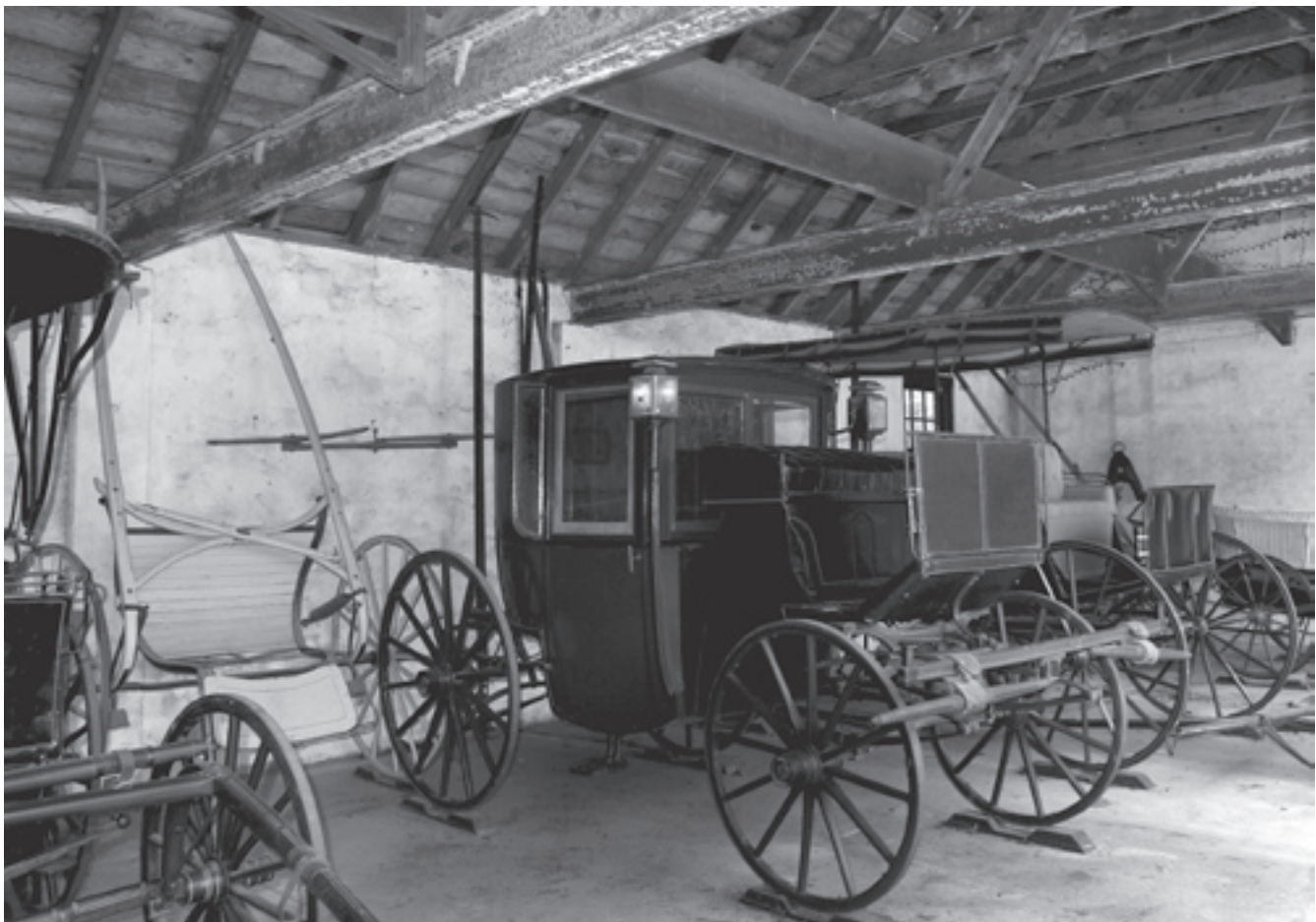
Buggies, Middleton Place Plantation

The conference photo tours in and around the Charleston area are planned for Sunday, Monday and Tuesday, October 3rd through the 5 th . Two