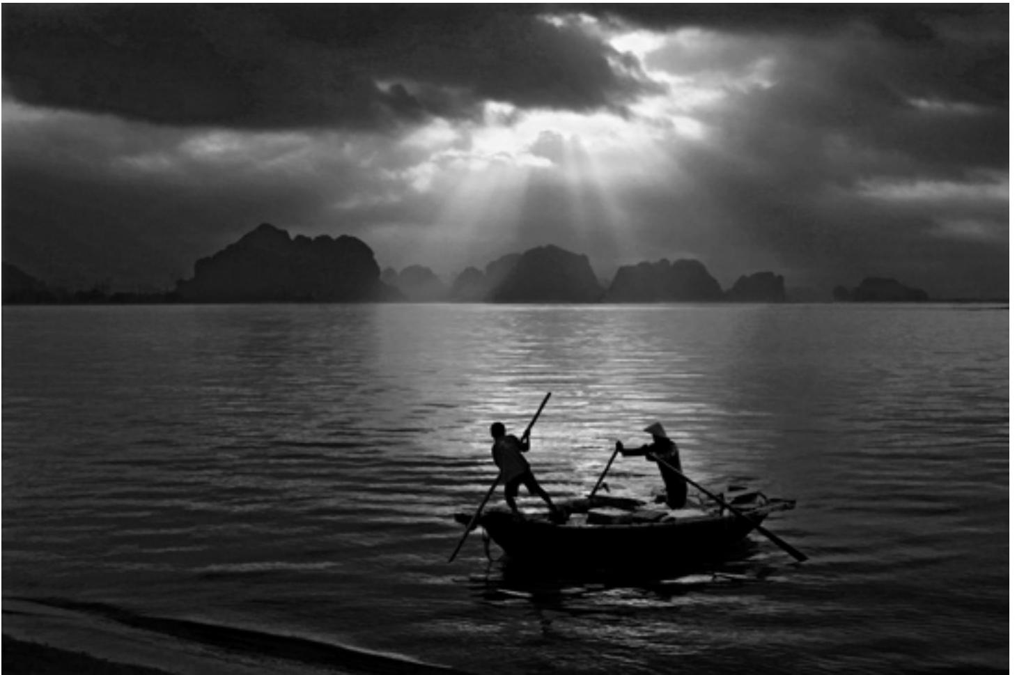
On Halong Bay