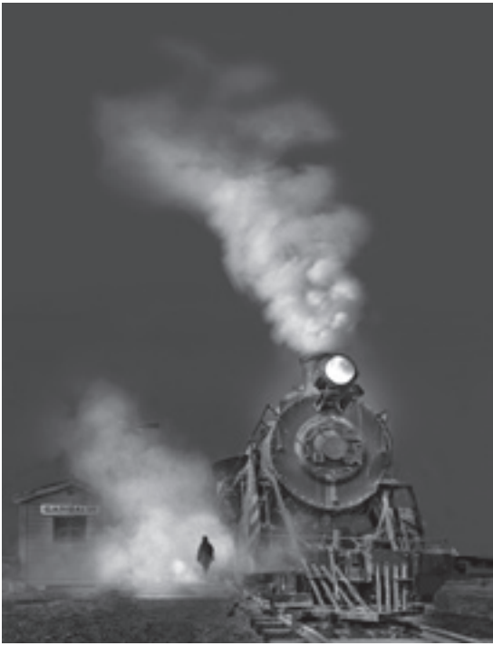
Short Stop in Garibaldi

Association. He has exhibited photographs on all 7 continents.