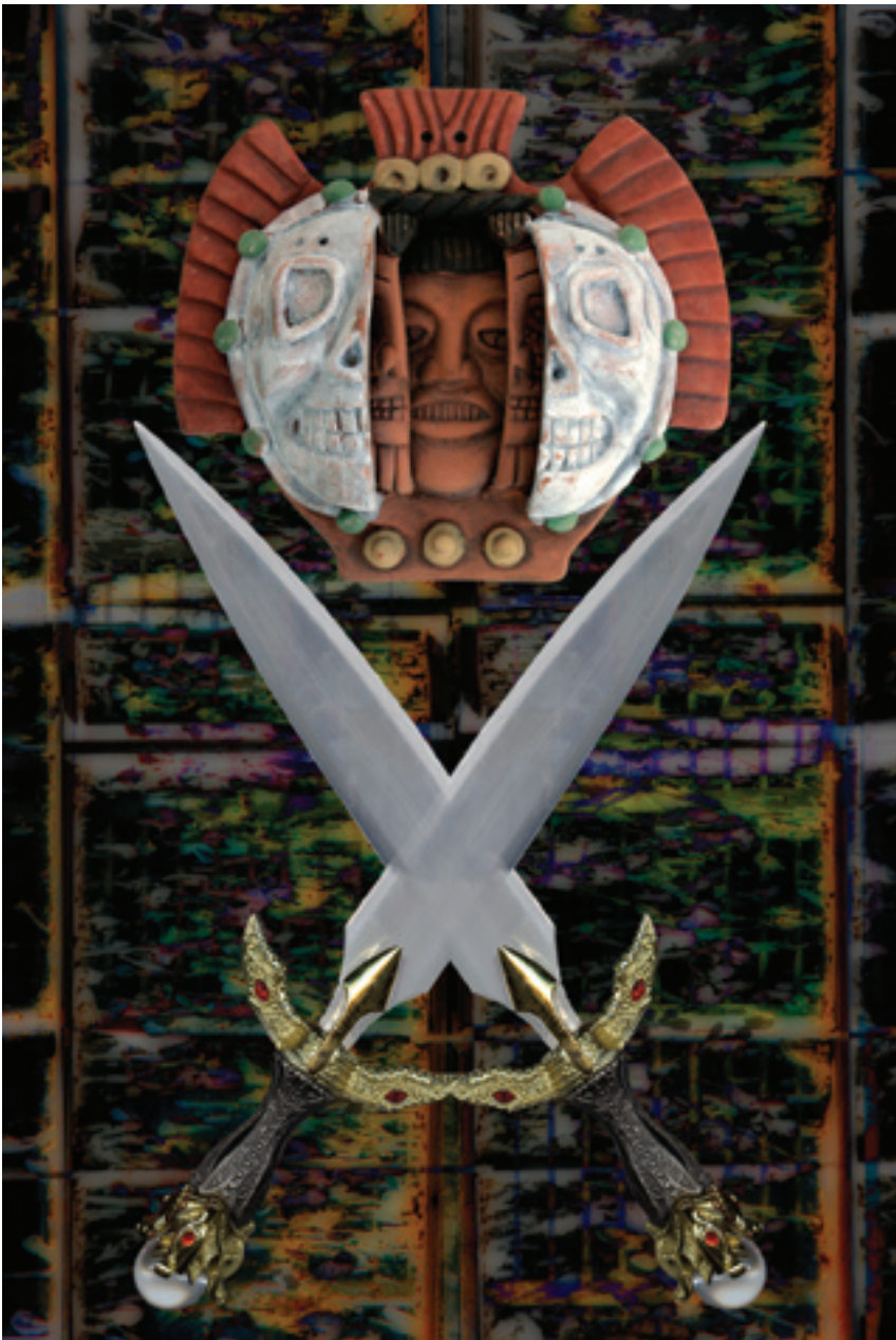
Mask and crossed swords