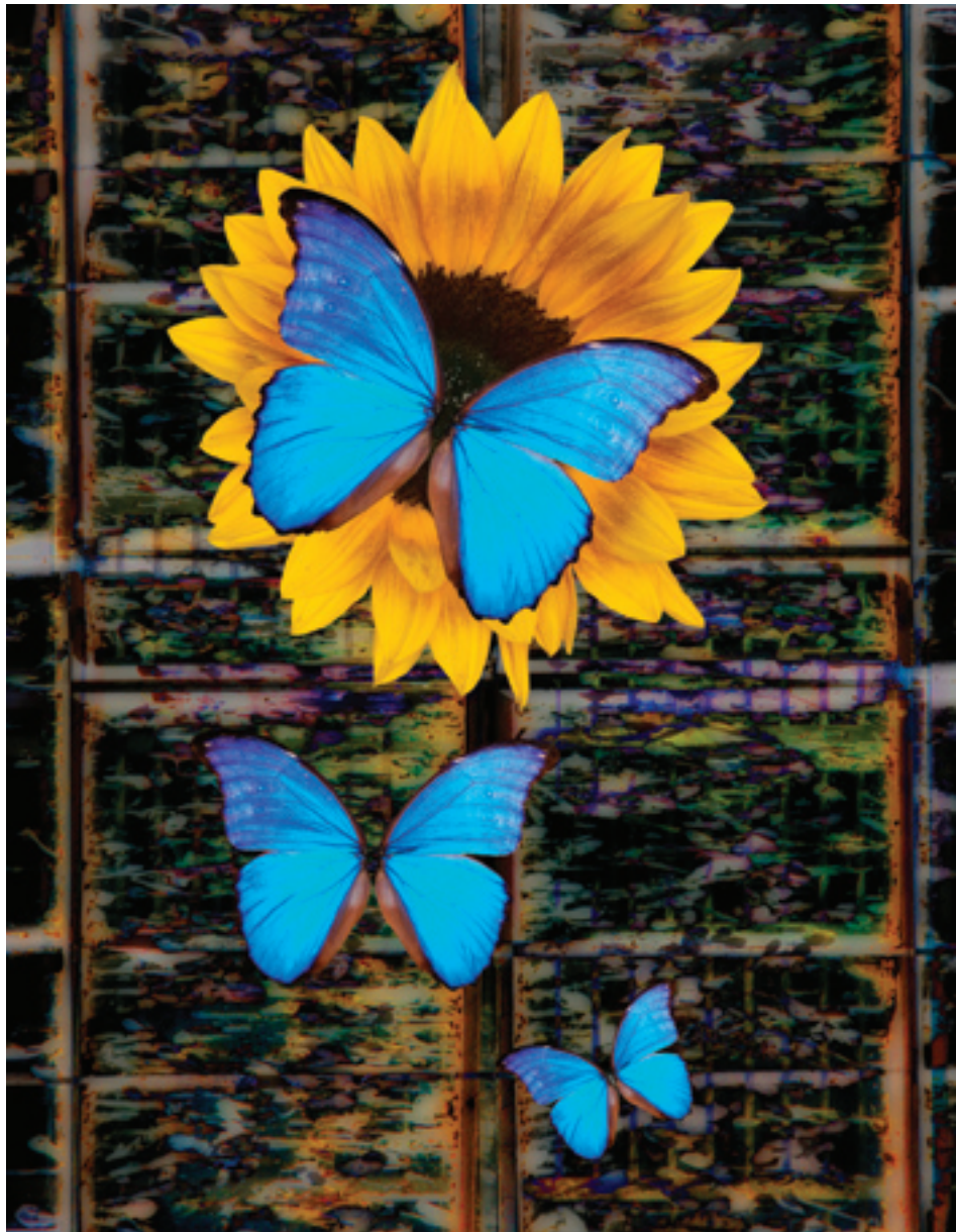
Butterflies and flowers