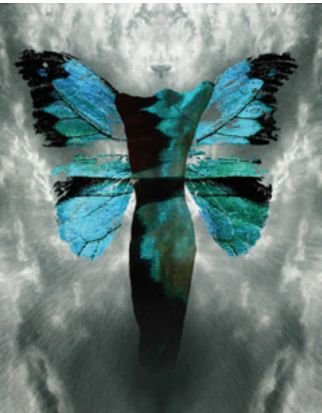
Statue and wings in sky