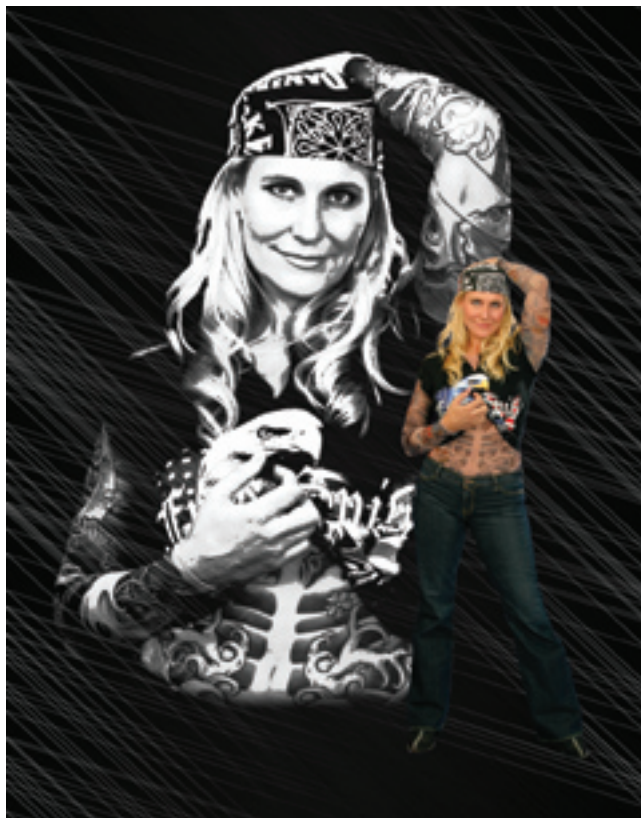
Sin City biker