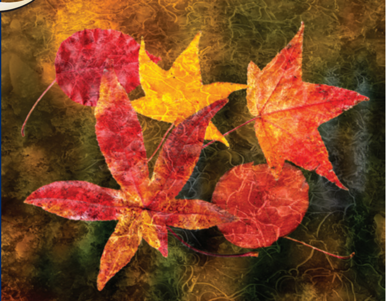
Five leaves in ice